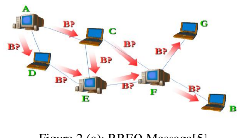
Figure 2 (a): RREQ Message[5]

Nodes receiving this data packet update their information for the source node and set up backwards pointers to the source node in the routing tables. A node receiving the RREQ may send a route reply (RREP) if it is either the destination or if it has number more than or equal to that contained in the RREQ [5]. It uses sequence numbers to ensure the freshness of routes. It is loop-free, self-starting, and scales to large numbers of mobile nodes [5]. Figure 2(a) and 2(b) shows the example of sending RREQ packet and RREP Packet.