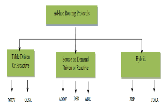
Figure 1. Classification of MANETs Routing Protocols [8]

International Journal of Advanced Research in Computer and Communication Engineering Vol. 4, Issue 6, June 2015